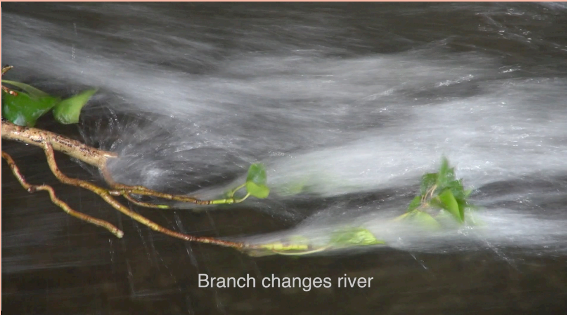
Branch changes river

In these short films I have attempted to provide glimpses of some personal feelings, thoughts and pre-occupations that are accompanying my journey into this territory, in the hope they might provide some insight.