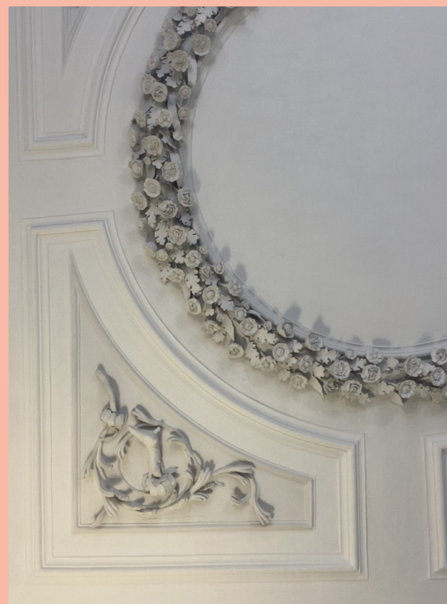
Plaster ceiling design inspiration at the Custom House